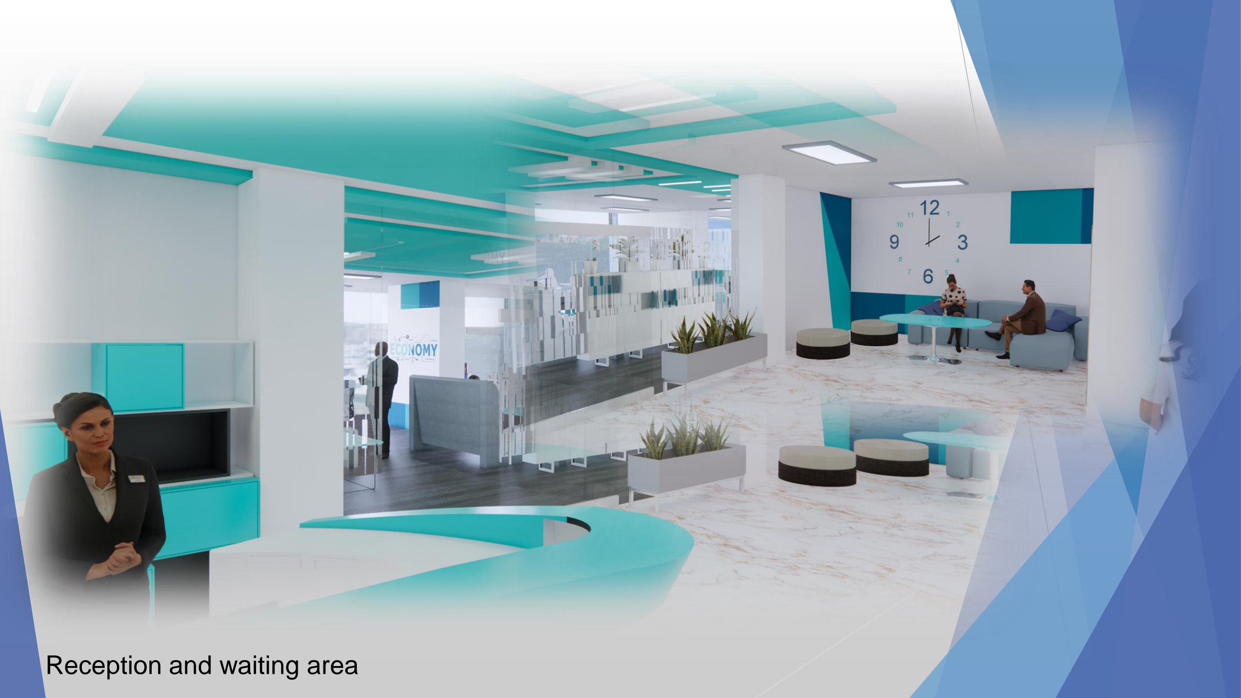
Reception and waiting area