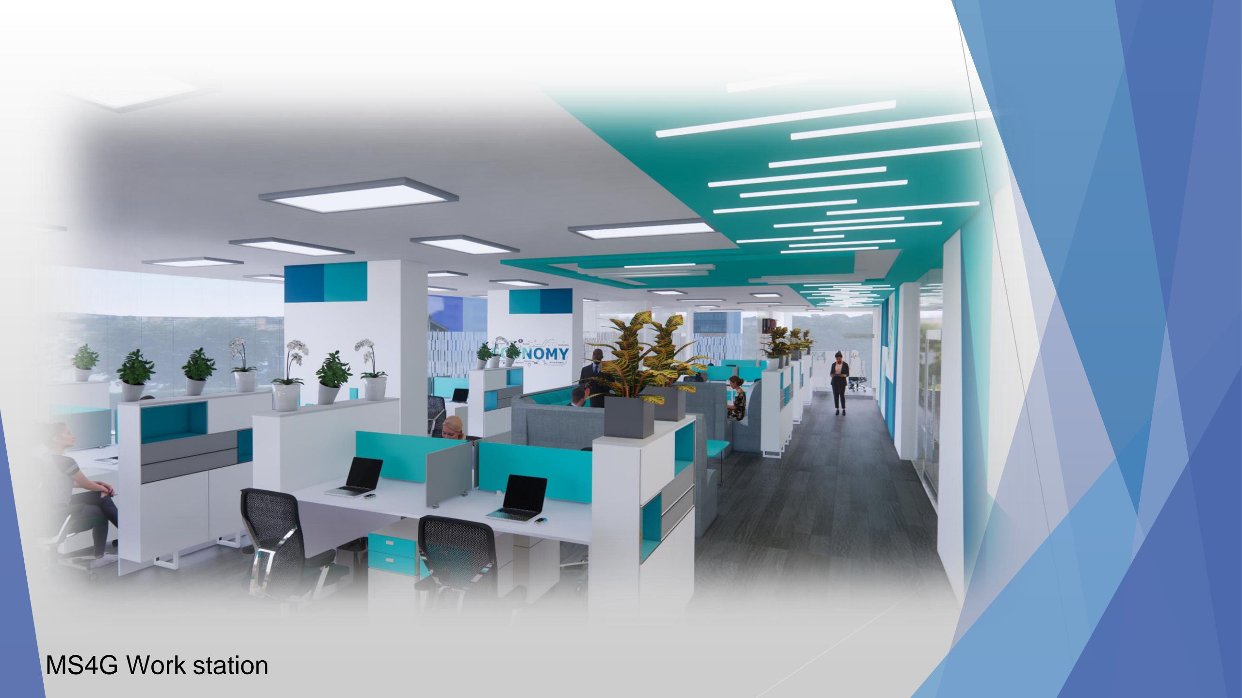
MS4G Work station