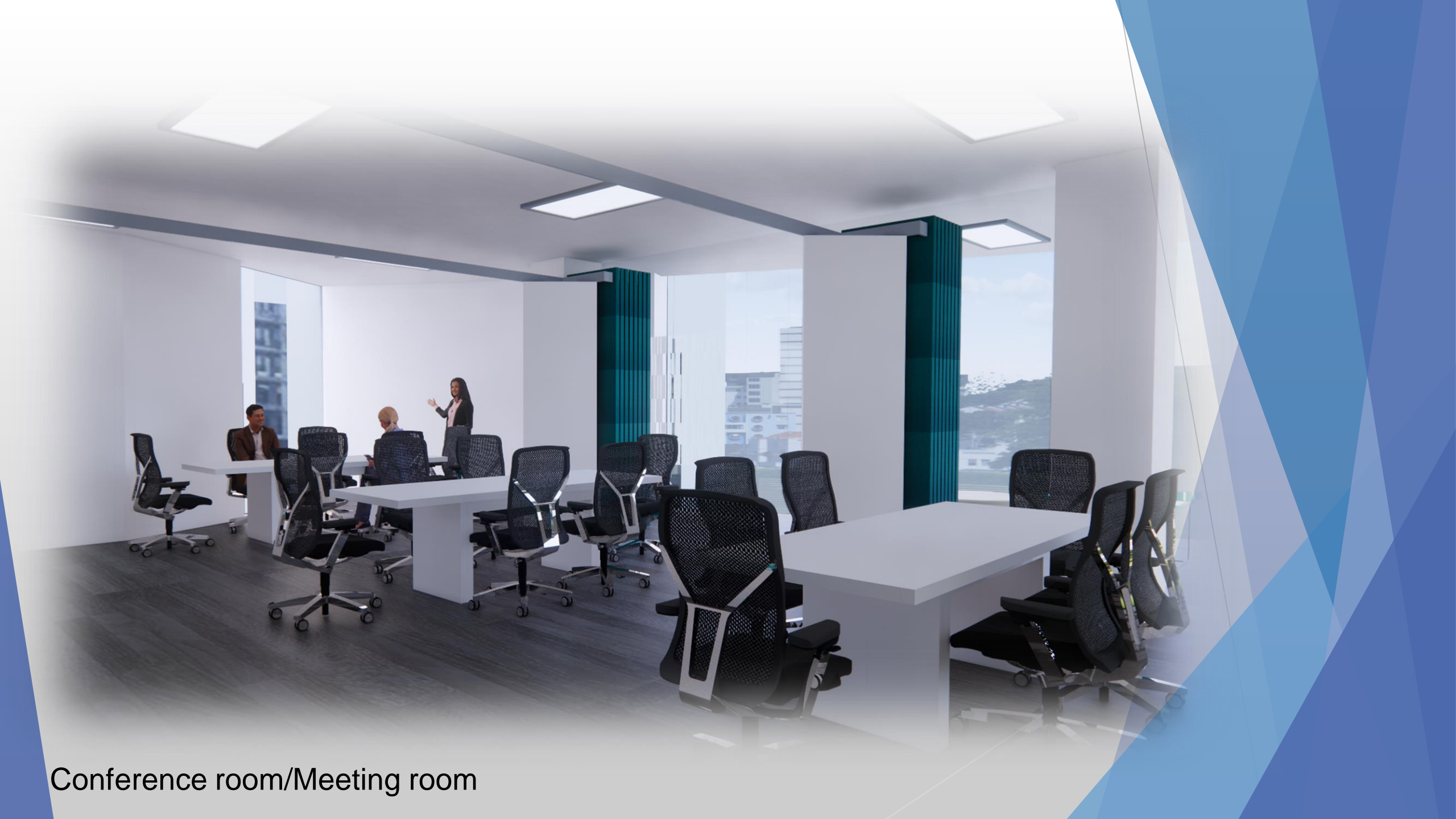
Conference room/Meeting room