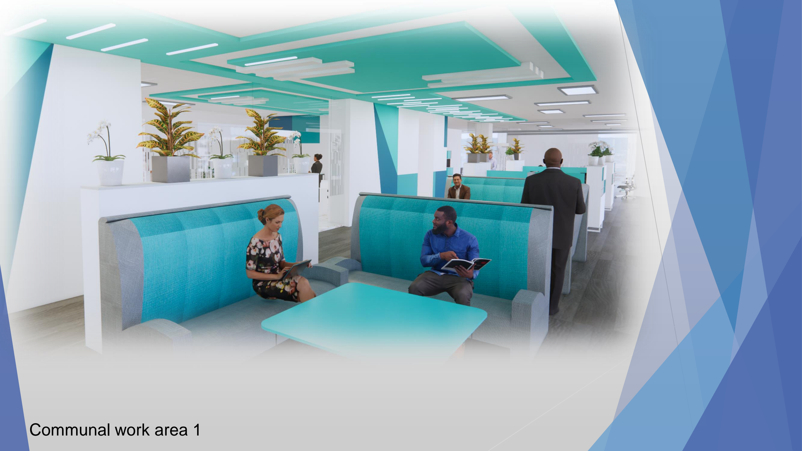
Communal work area 1