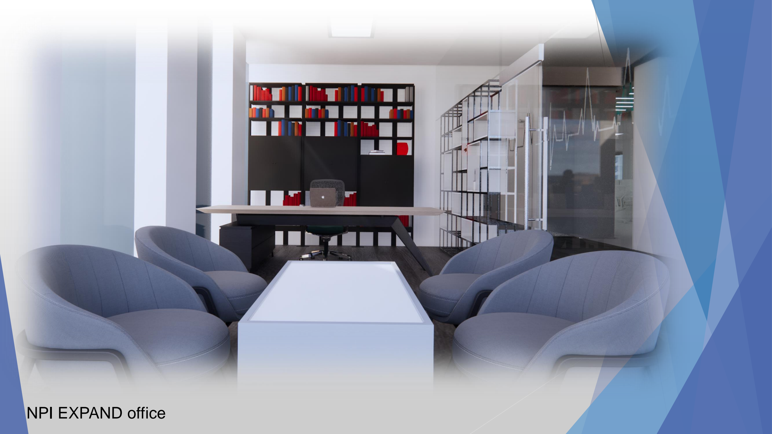
NPI EXPAND office