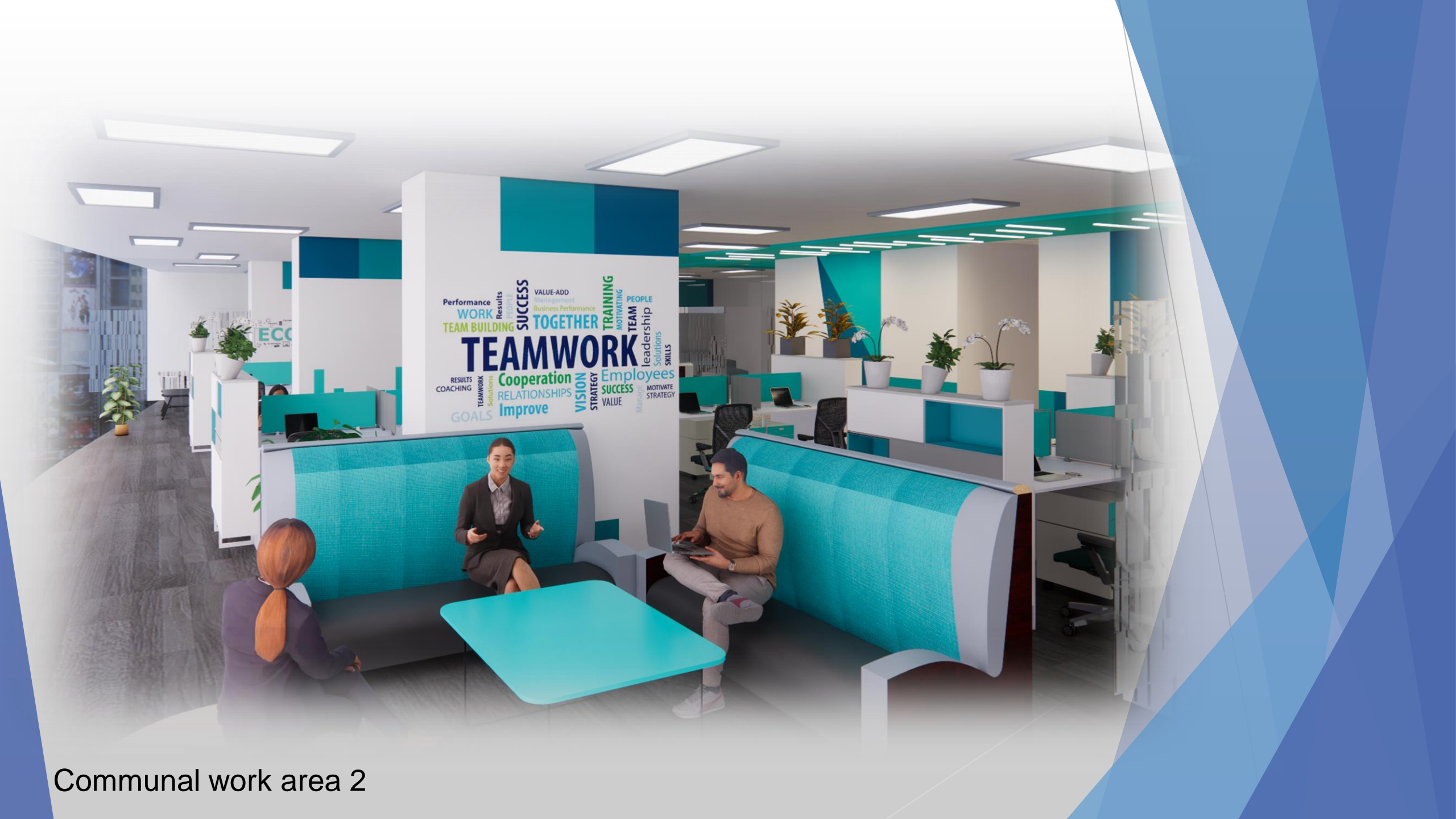
Communal work area 2