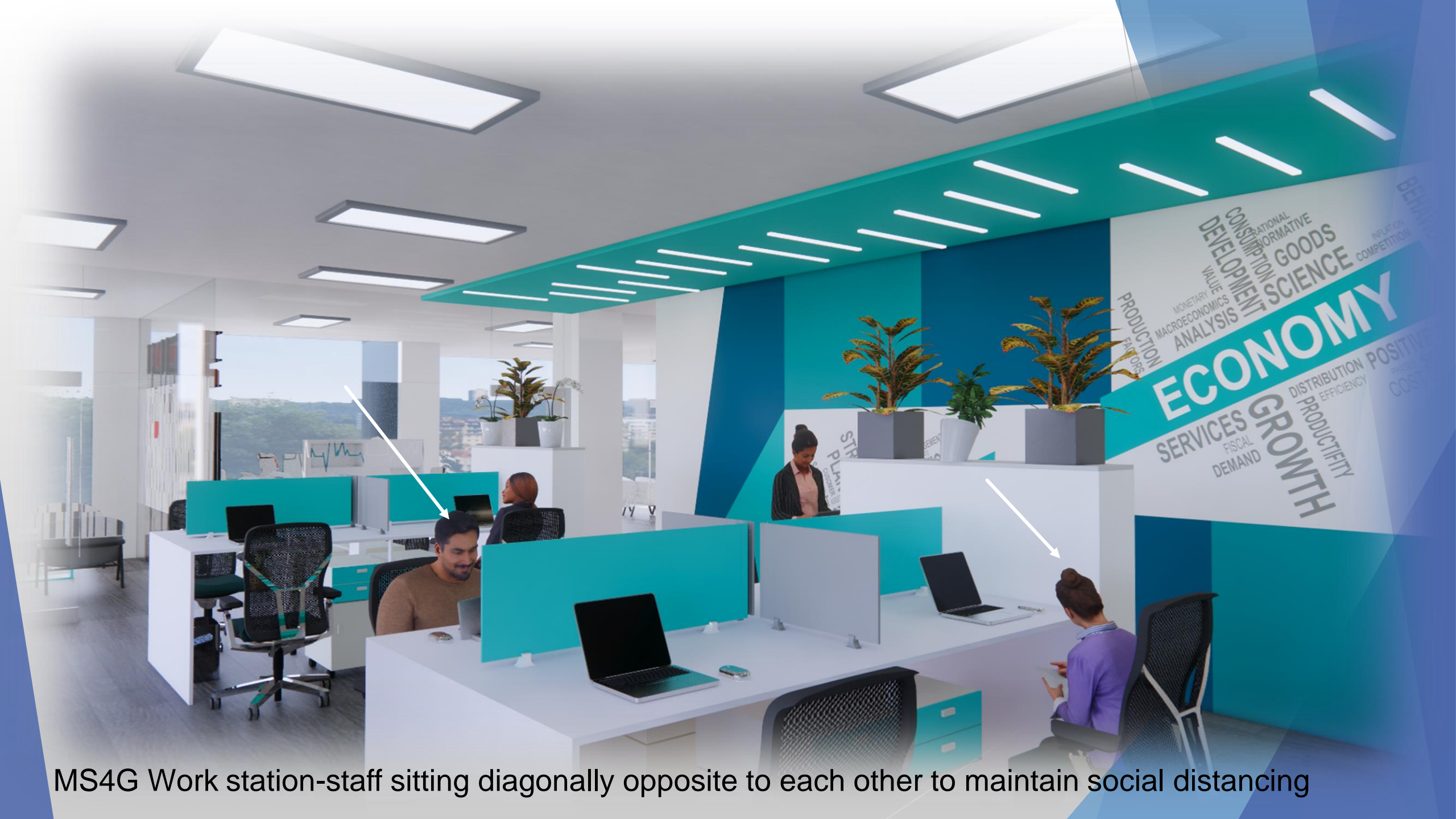
MS4G Work station-staff sitting diagonally opposite to each other to maintain social distancing