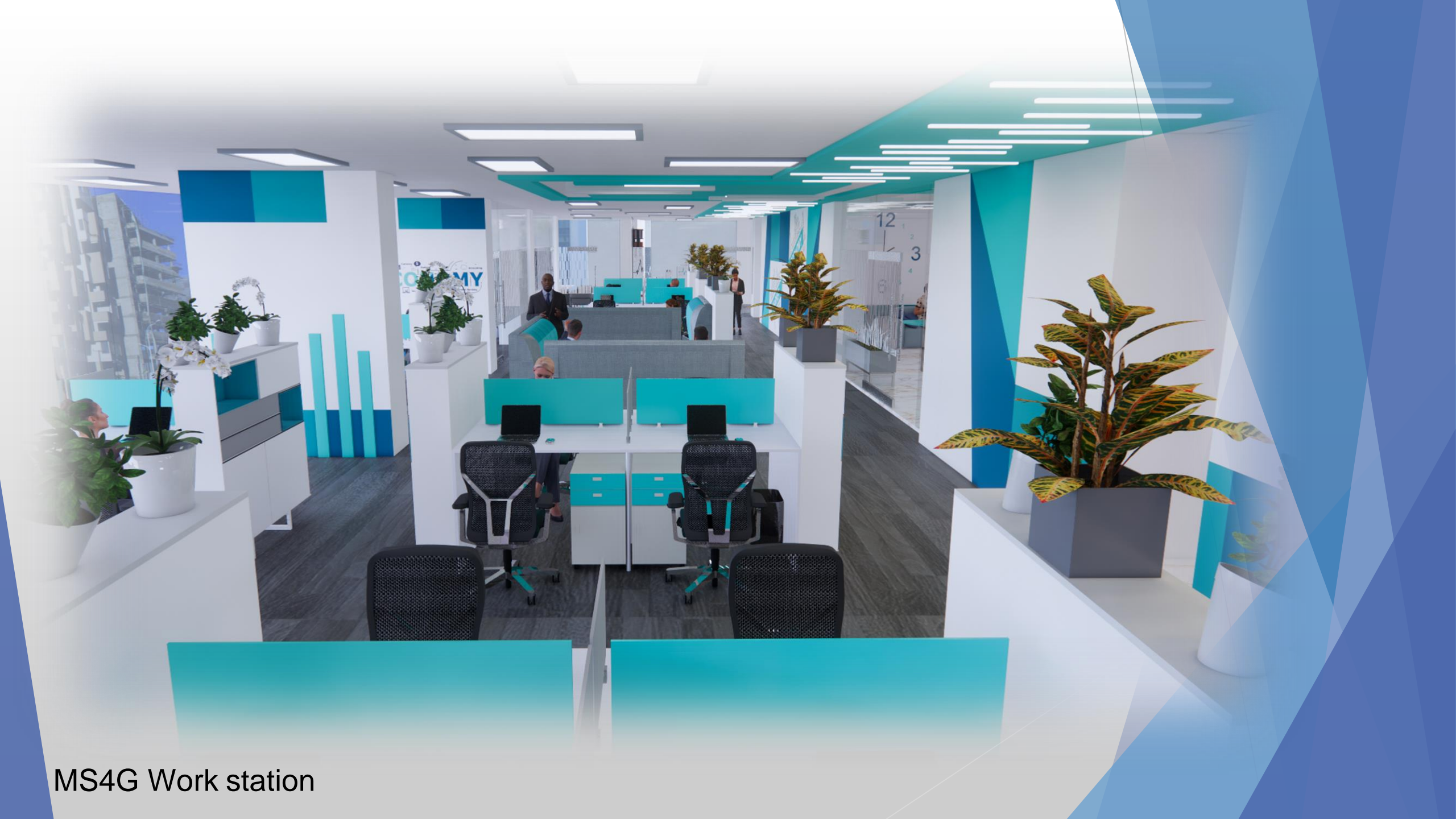
MS4G Work station