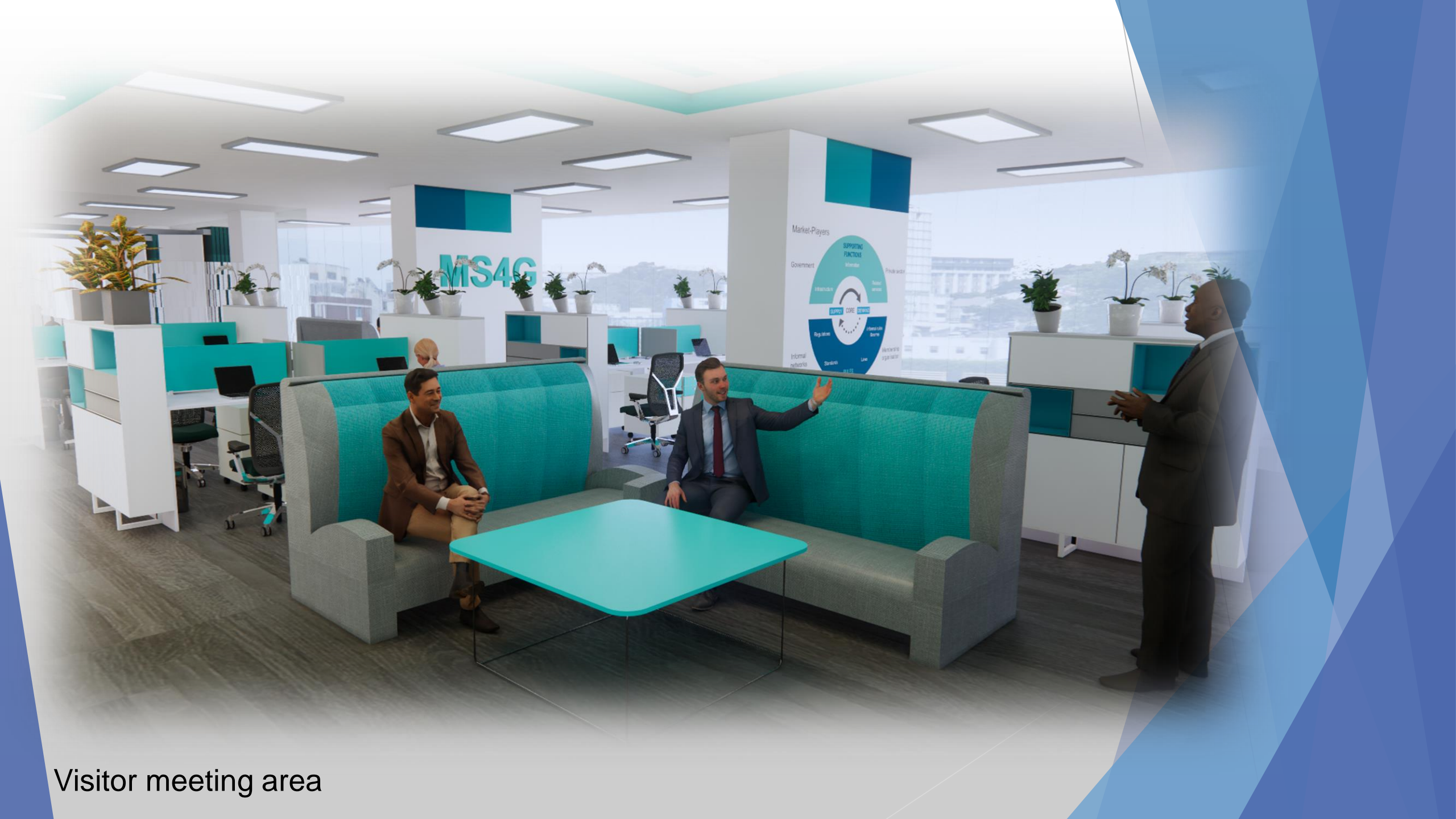
Visitor meeting area